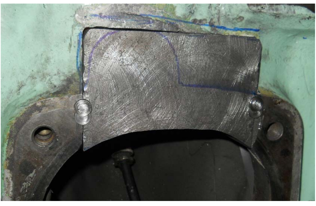
Final Report LOCK-N-STITCH Inc. Page 4 of 9