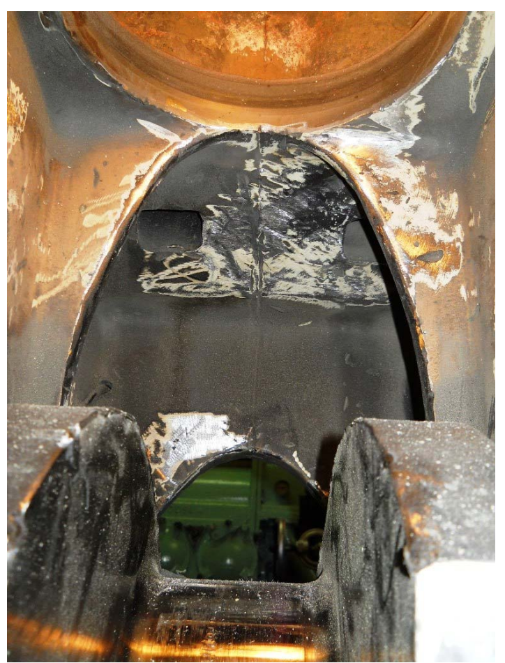
Final Report LOCK-N-STITCH Inc. Page 8 of 9