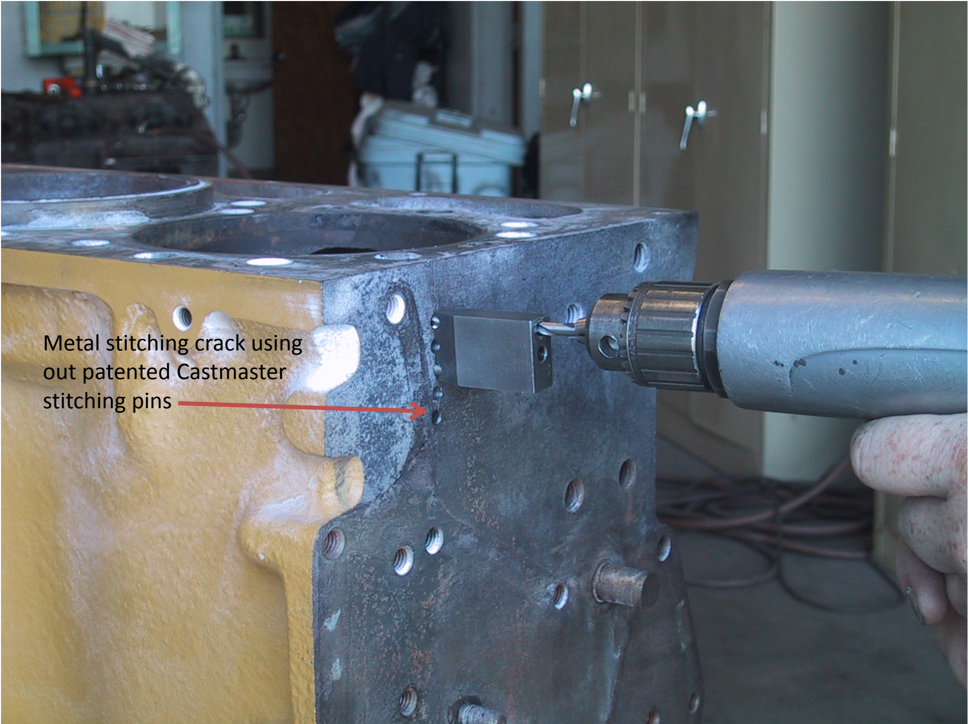
Metal stitching crack using out patented Castmaster stitching pins