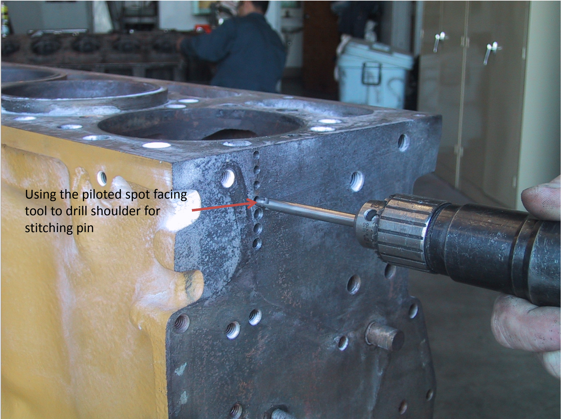
Using the piloted spot facing tool to drill shoulder for stitching pin