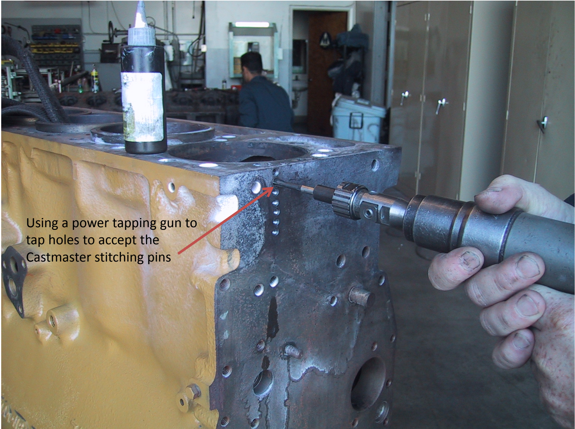
Using a power tapping gun to tap holes to accept the Castmaster stitching pins