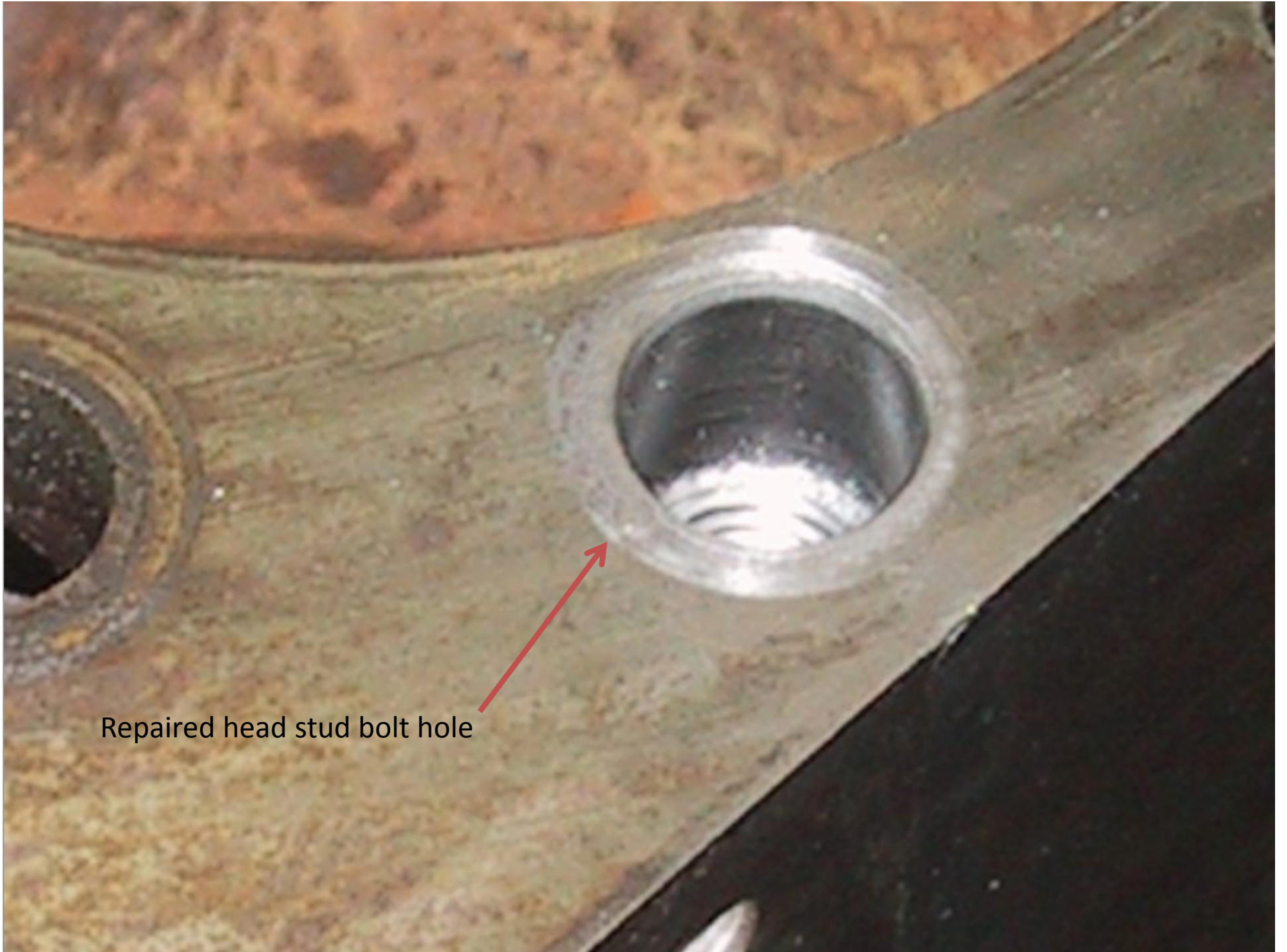
Repaired head stud bolt hole