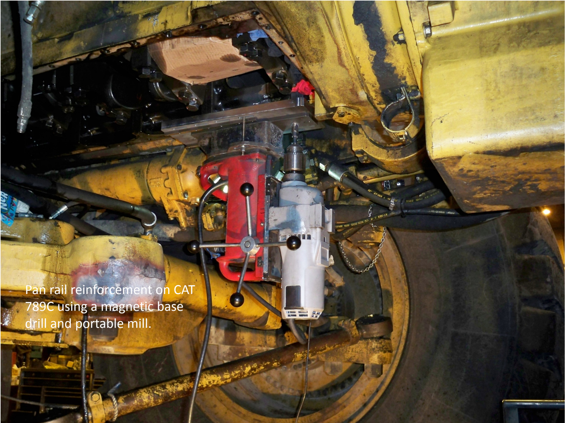
Pan rail reinforcement on CAT 789C using a magnetic base drill and portable mill.